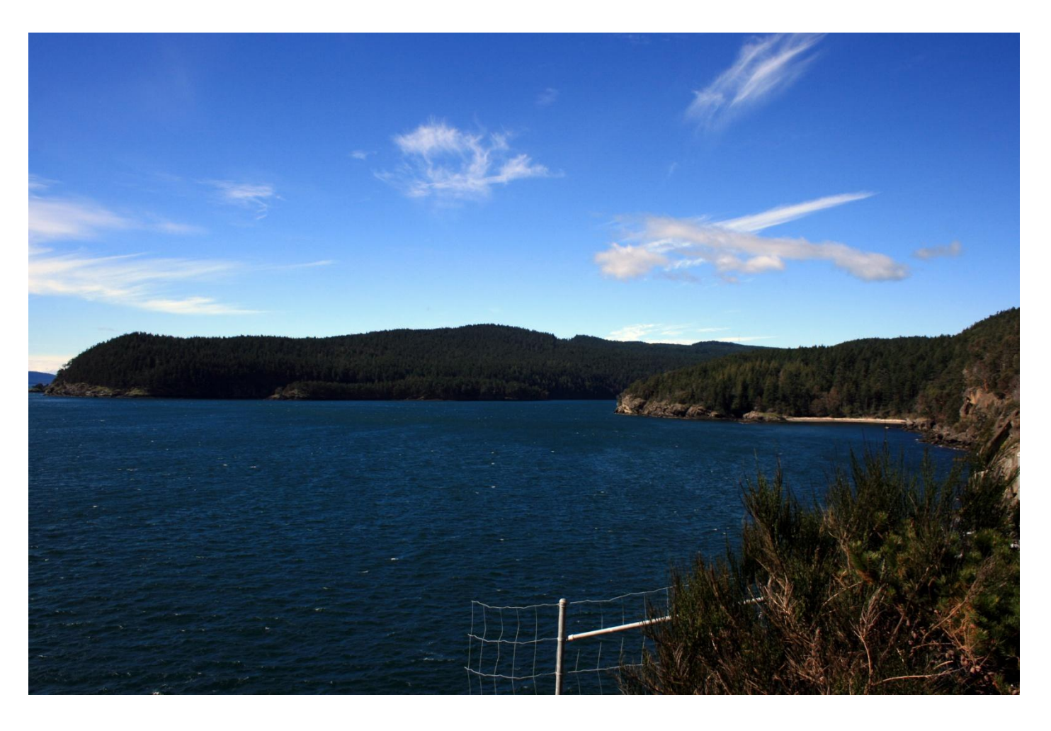
Address: 130Clíffsíde Road, Saturna Island

An Incredibly Beautiful Oceanfront View!!