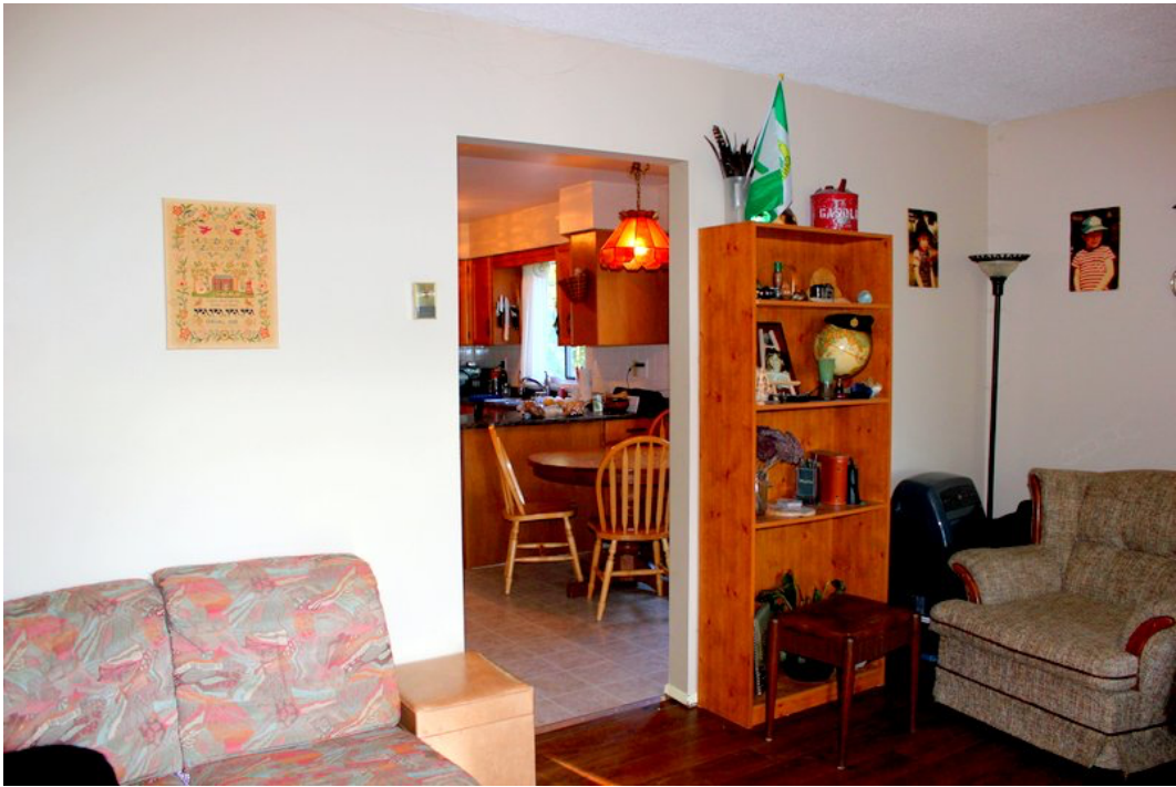
Kitchen Dining Area